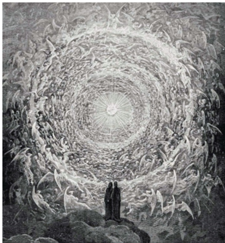
Vision of Paradise in Dante's Paradiso as illustrated by Gustav Doré (1832-1883)

Last year, on January 10, 2022, at 5 p.m., I was at the bedside of my mother. It was day 11 since the hospice nurse said she could pass at any moment. Hers was a long “active dying” process by any measure. When I arrived for my turn with her keeping watch (my sister left just an hour before), I saw that she was struggling with her breathing. This was new as she had been serene and unconscious for many days. But I knew what to do. I got the hospice kit and administered drops of methadone and lorazepam under her tongue. These would soon alleviate the shortness of breath and any agitation. I called the hospice service for a nurse to call me back. As I waited, I said a bunch of prayers. The nurse called back and said