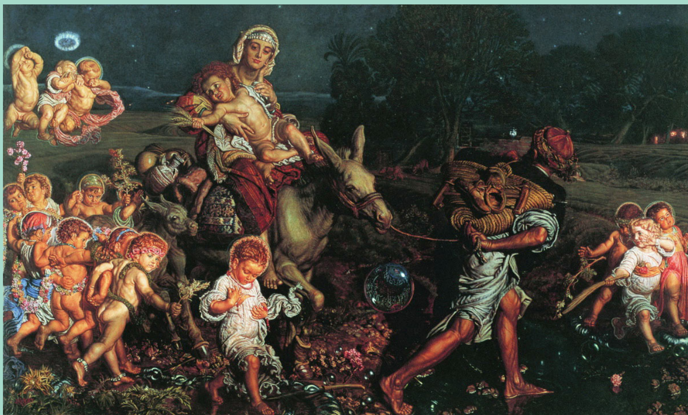
"The Triumph of the Innocents" by William Holman Hunt (1827-1910)

In this painting, the artist merges two events from the Gospels. The Massacre of the Innocents (Matthew 2:16–18) in which Herod the Great, king of Judea, ordered the execution of all male children who were two years old and under in the vicinity of Bethlehem. Joseph is warned about this in a dream and the Holy Family escapes into Egypt (Matthew 2:13). The Innocents as depicted as angelic babies with halos surrounding the baby Jesus, Mary, and Joseph – but as they are deceased only Jesus can see them. By tradition, the Innocents are deemed Christian martyrs and their feast day, Holy Innocents Day, is December 28. The "triumph" of the Innocents is that Herod failed to kill Jesus and they are able to see the Savior and enter the bliss of heaven.