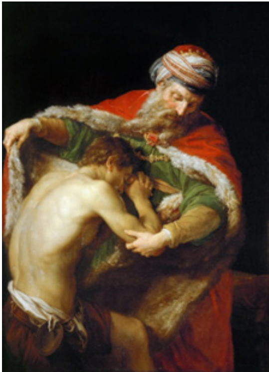
Return of the Prodigal Son (1773) by Pompeo Batoni (1707-1787)

I have chosen Teshuvah , the Hebrew word for repentance, as the theme for Lent. The literal meaning of Teshuvah is "return". Repentance is central to Judaism and Christianity. According to the Jewish Talmud, God created repentance before God created the physical universe (cf. Tractate Nedarim 39b, Babylonian Talmud). Jesus inaugurates his public ministry with a symbolic act of