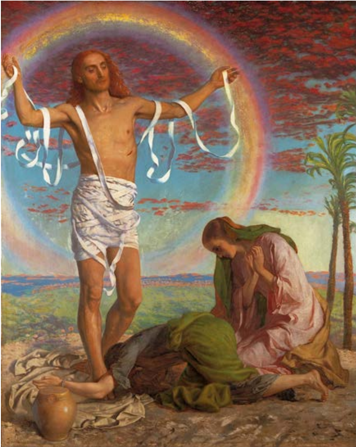
The Risen Christ with the Two Marys by William Holman Hunt (1827-1910)