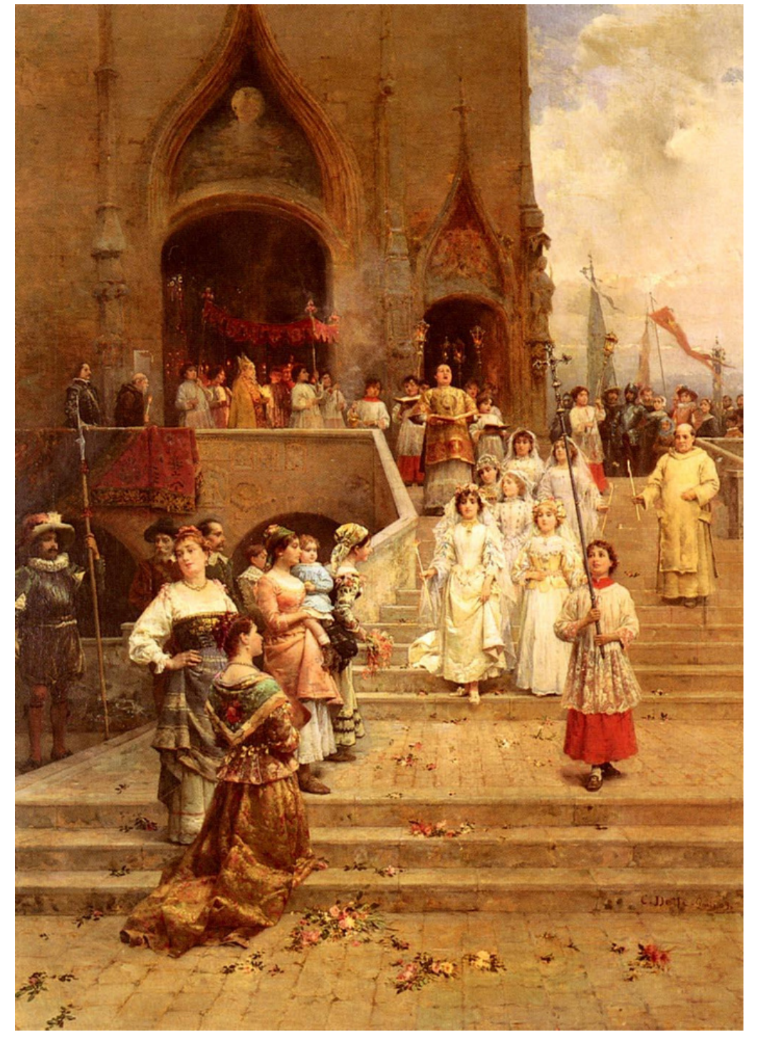
The Confirmation Procession, 1889, Cesare-Auguste Detti