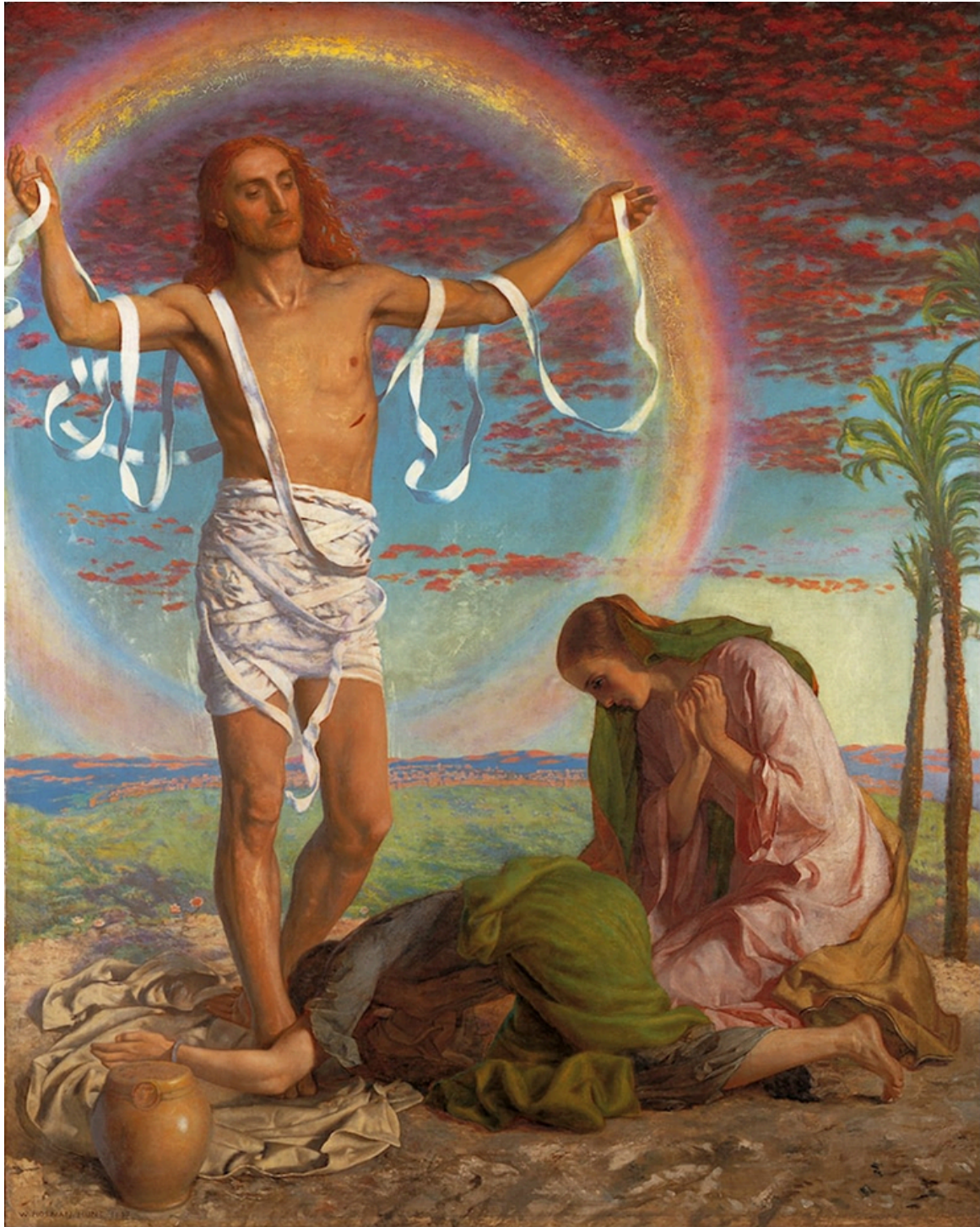
“The Risen Christ with the Two Marys,” by William Holman Hunt (1827–1910)