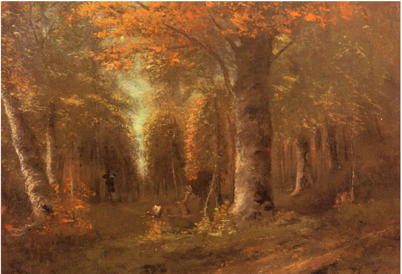
"Forest in Autumn" by Gustave Courbet, 1841