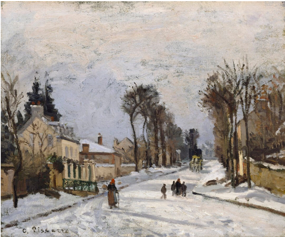
“Road to Versailles at Louveciennes” 1869, by Camille Pissarro